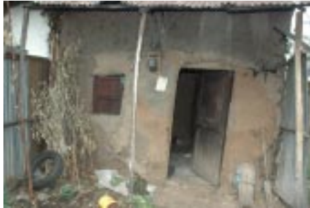
Emama (Mother) Desse (above) spins thread from cotton (above right); her home is shown below right. For the elderly, each day is a struggle to live