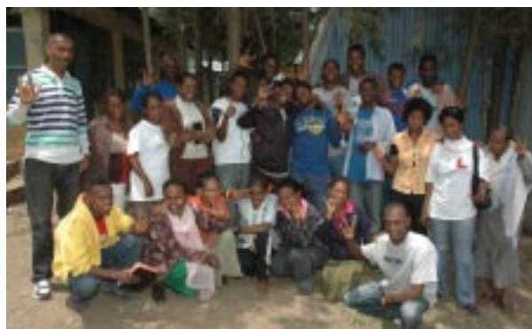
Members of the Deaf Ministry at Addis Ababa