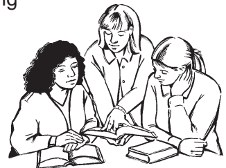
Women's Bible Study

As customary, this last class will include an end-of-season luncheon. The class meets at 10:15 am in Room 123. Visitors are welcome!