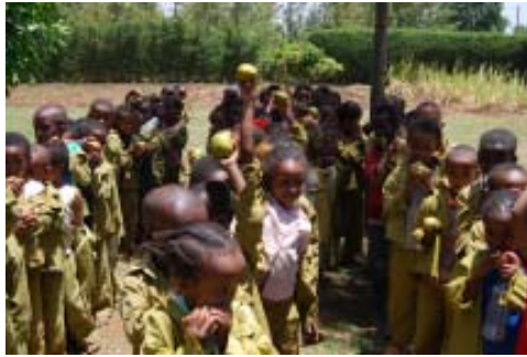
Shinshitcho children enjoying a mango break

“Esther” at the school and then showed the movie “David and Goliath” at the church in the nearby town of Hosanna.