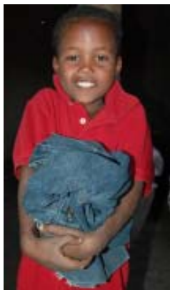
items (right and below)