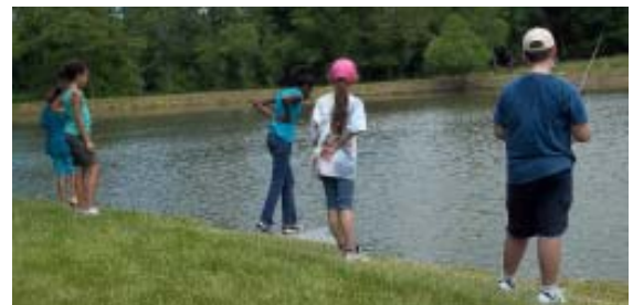
Fishing in the pond (above); tractor ride (below)