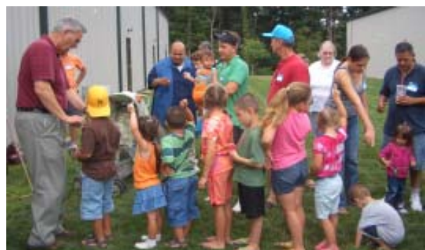
VBS in South County, RI, in 2010