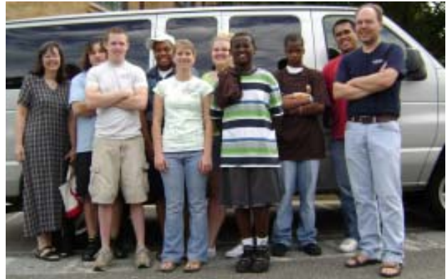
The 2007 Falls Church group! Recognize anyone?

In addition to the VBS, there will be ample opportunities to share the word of God.